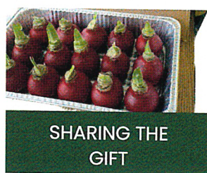
SHARING THE GIFT