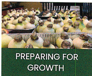
PREPARING FOR GROWTH

The bulbs became a metaphor: we have everything we need when we share what we have.